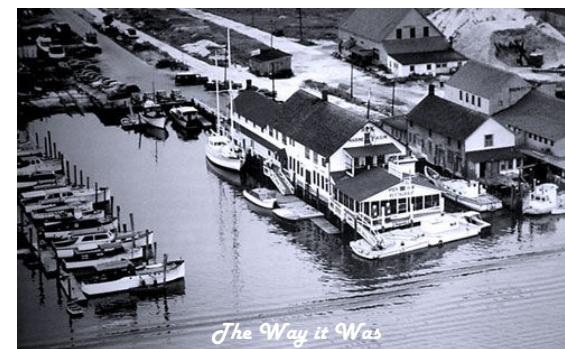
The Way it Was

OVER 70 YEARS SERVING THE BOATING COMMUNITY