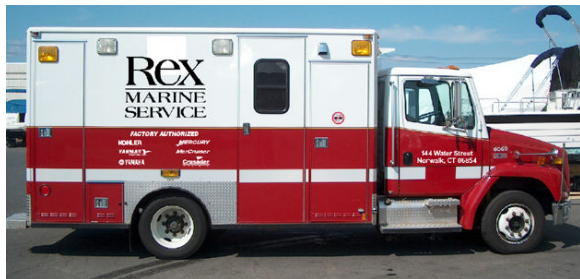
Extensive off-site capabilities

Our objective at Rex Marine is to provide unsurpassed service to our customers. It is our intention to operate a truly “full service” boating center that is professionally staffed with conscientious, courteous, employees and management, and to remain a progressive marine operation with high industry-wide visibility. Our company recognizes that it is the responsibility of all of our fine employees to strive toward this goal.