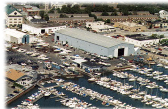
Modern—With our Indoor Rack Service Facility

OVER 70 YEARS SERVING THE BOATING COMMUNITY